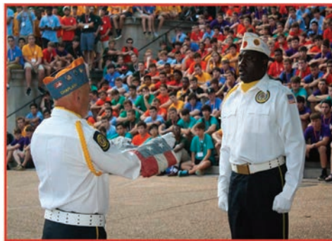
The American Legion conducts a flag retirement ceremony in presence of Boys State delegates.