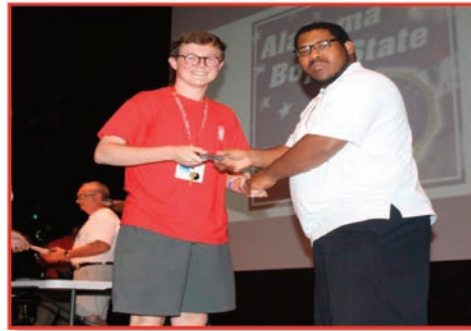
Delegate being awarded medal for outstanding merit during the week by staff counselor.